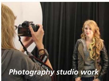
Photography studio work