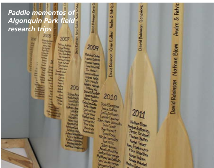
Paddle mementos of Algonquin Park field research trips

Currently there are no new details to report. However, we anticipate providing a detailed fire hall update in a future issue of @TD, likely next spring.