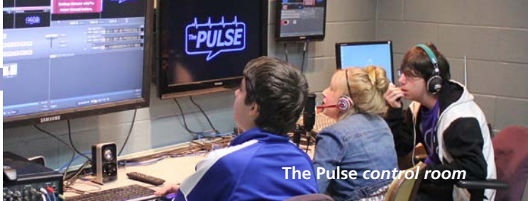
The Pulse control room